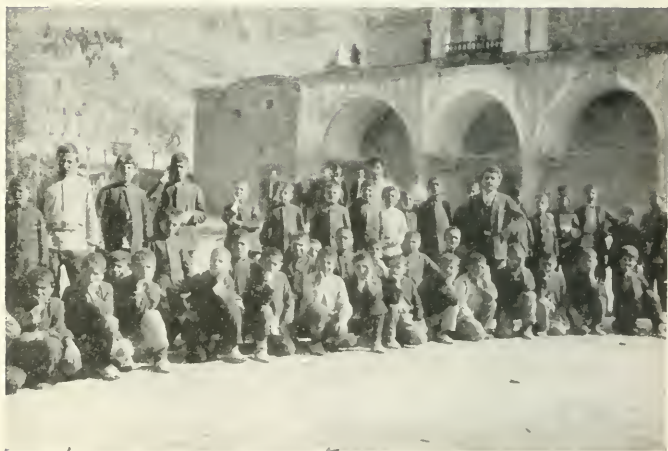
SCHOOLBOYS AT VARAG MONASTERY